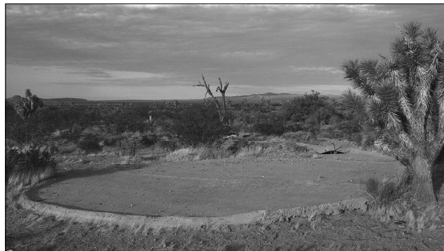
Guzzler B-172, which was full in August, is on the edge of Kingston Wash north of Interstate 15 at the Cima Road exit.

There were also quail and doves all around Valley Wells, even though I couldn't find any surface water when I was there in August.